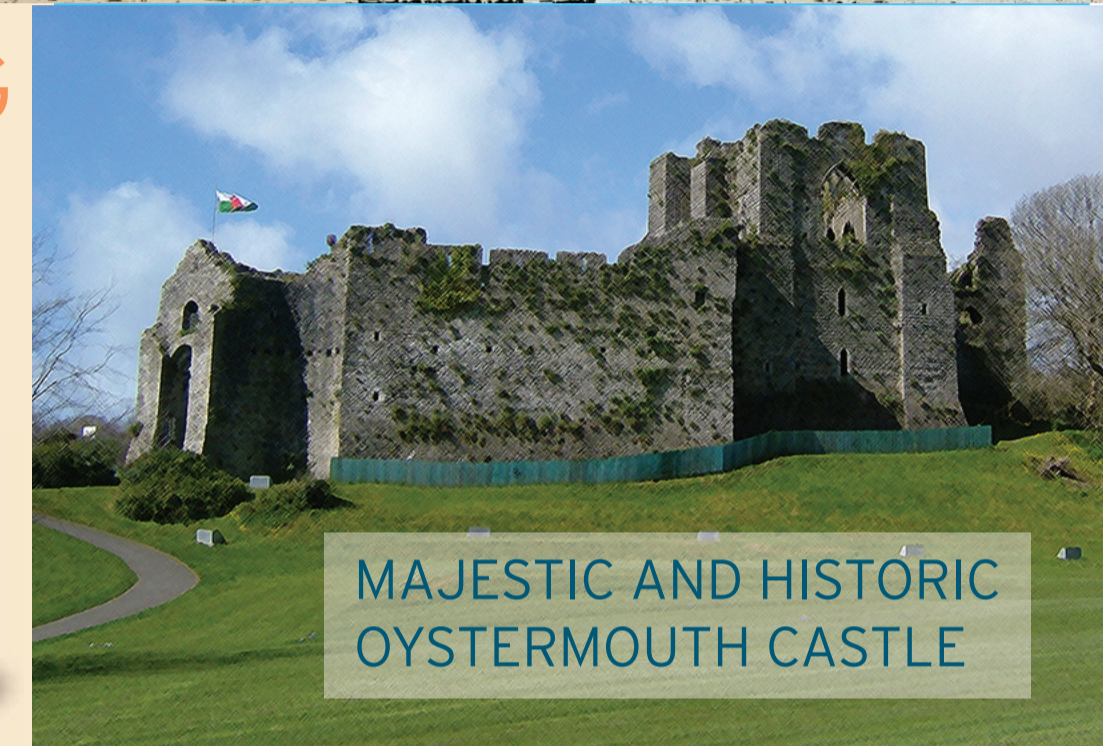
MAJESTIC AND HISTORIC OYSTERMOUTH CASTLE